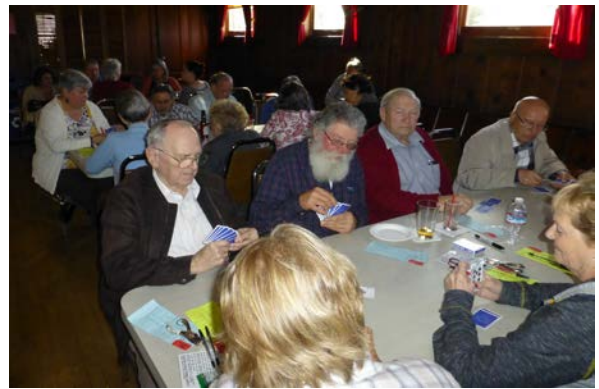
Jassers enjoying a nice afternoon with friends.