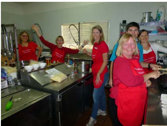
Wonderful crew who prepared fantastic Fondue!